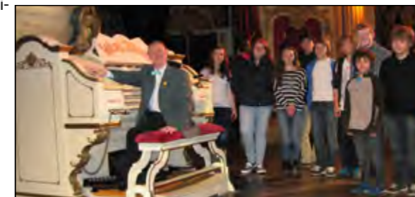
Photo shows students with Blackpool Tower team Organist David Lobham during our trip to the North West